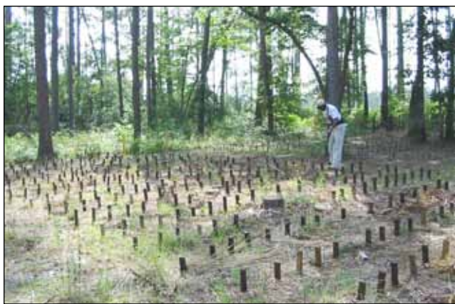
Figure 15–1. Field stake test plot at Harrison Experimental Forest in southern Mississippi.

preservatives may also be used at lower retentions to protect wood exposed in lower deterioration hazards, such as above the ground. The exposure is less severe for wood that is partially protected from the weather, and preservatives that lack the permanence or toxicity to withstand continued exposure to precipitation may be effective in those applications. Other formulations may be so readily leachable that they can be used only indoors.