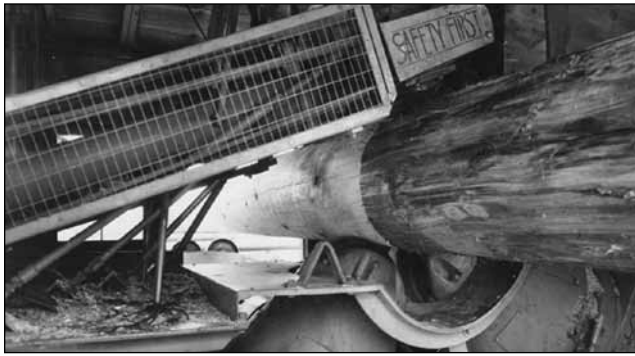
Figure 15-3. Machine peeling of poles. The outer bark has been removed by hand, and the inner bark is being peeled by machine. Frequently, all the bark is removed by machine.