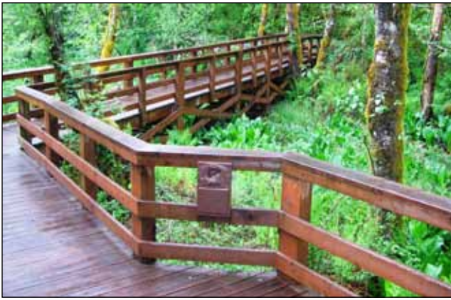
Figure 15–7. Wood preservative leaching, environmental mobility, and effects on aquatic insects were evaluated at this wetland boardwalk in western Oregon.

As with many materials, reuse of treated wood may be a viable alternative to disposal. In many situations treated wood removed from its original application retains sufficient durability and structural integrity to be reused in a similar application. Generally, regulatory agencies also recognize that treated wood can be reused in a manner that is consistent with its original intended end use.